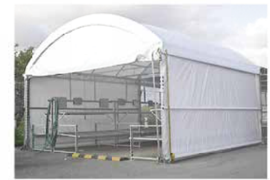
FROST PROTECTION (Optional)