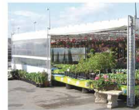
WIND PROTECTION (Optional)