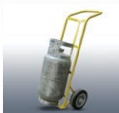
CD-2346 Cylinder Dolly