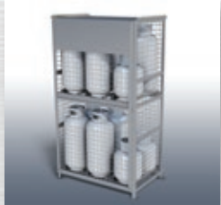
PCSC-B1 39" w x 27" d x 72" h 1 removable shelf