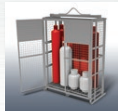
PCCL-D Certified Lifting Device 58" w x 29" d x 82" h