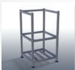
PCB3636 Handling/ Transportation Cage 36" w x 36" d x 64" h (outside dimensions) 32" w x 32" d x 57" h (inside dimensions)