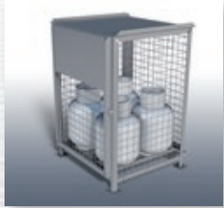
PCSC-A-S 27" w x 27" d x 40" h