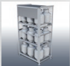
PCSC-B2 39" w x 27" d x 72" h 2 removable shelves