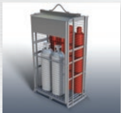
PCCL-B Certified Lifting Device 45" w x 28" d x 82" h