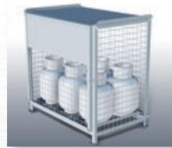
PCSC-A 39" w x 27" d x 40" h