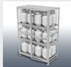
PCSC-D2 51" w x 27" d x 72" h 2 removable shelves