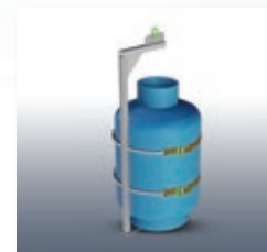
PTLD-60 Propane Tank Lifting Device