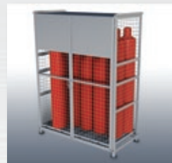
PCSC-D1-O/A 51" w x 27" d x 72" h