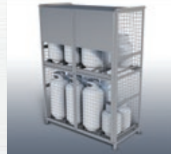
PCSC-D1 51" w x 27" d x 72" h 1 removable shelf